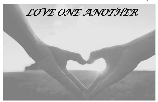
All Age Service 6<sup>th</sup> Sunday of Easter 5th May 2024

We expect to livestream this service. We all join in the words in bold type. At the points where you are invited to stand , please remain seated if you prefer.